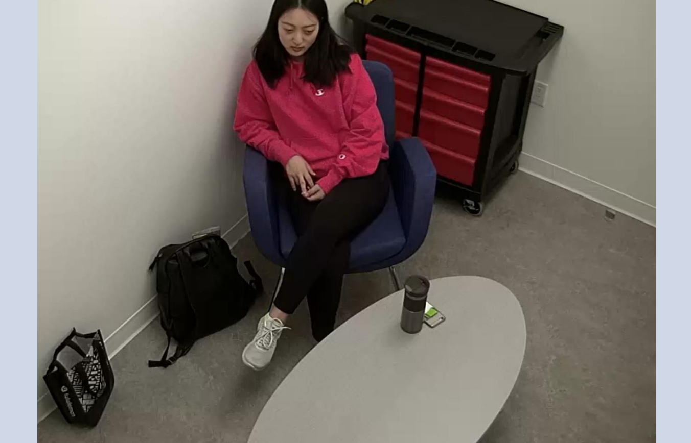
Figure 2. The set-up of the procedures.